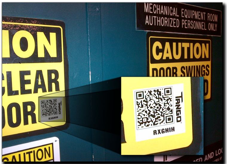
Figure 2 - Quick Response (QR) Codes used to start routes within this Mechanical Room

As the current readings at the hospital are scanned, all data and imagery is uploaded directly into the online database. The equipment’s history can be pulled up during the inspection rounds and notes can be added on the spot. IR scanning reveals the breakers and connections that are going bad, among other problem conditions. Some are fixed on site, while others are scheduled for maintenance by hospital personnel.