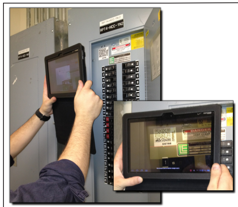
Figure 3 - Employee using a smart device to scan a QR code on a breaker panel.

In addition to the thermal inspections, to meet federal and state requirements for health care facilities, the maintenance team performs monthly generator tests under load as well as weekly no-load exercises and daily shift inspections. Maintenance personnel also perform visual inspection patrols at least once a week. They’ll get into closets to make sure they are clean, the lights work, and the covers are properly secured. During the generator tests and visual walkarounds, operating parameters such as voltage, current, water flows, temperature and more are read into the new reliability information system.